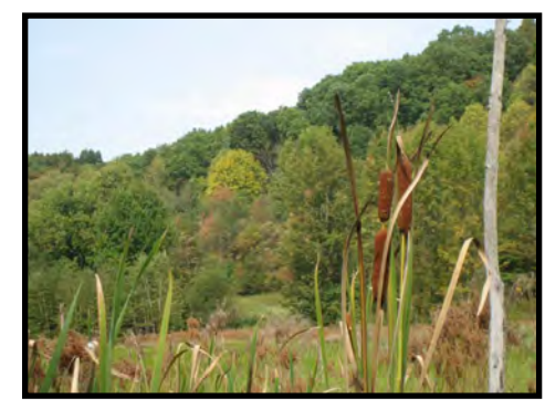
Paines Crossing Special Area (above) Front cover photo is Dismal Creek.

USDA is an equal opportunity provider and employer.