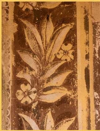
Historic Tecumseh Theater