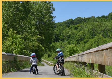
Hock Hocking Adena Bikeway, #17