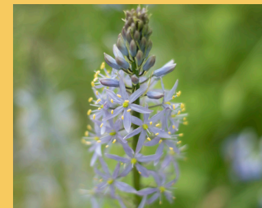
Wildcat Hollow, #13