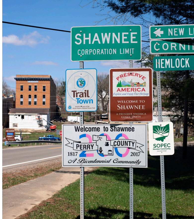
COVER: A view from the front of Tecumseh Lake, in Shawnee, #1. ABOVE: Signs are seen on Highway 93 with Shawnee in the background. OPPOSITE: The sun peaks out over Robinson's Cave, #5, in New Straitsville.