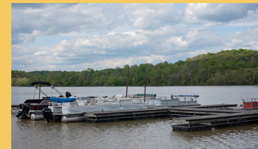
Burr Oak State Park, #14