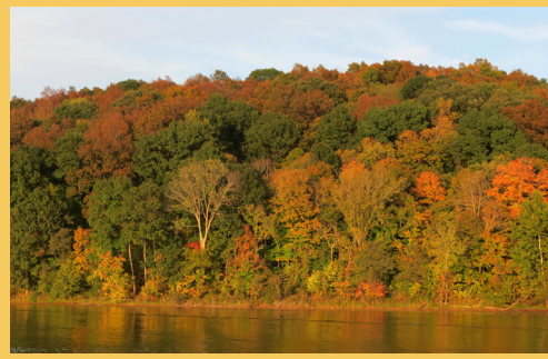
Burr Oak State Park, #14