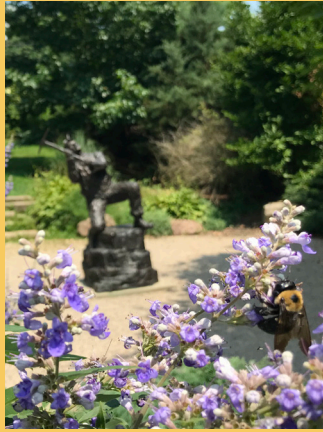
Miner's Park, Shawnee