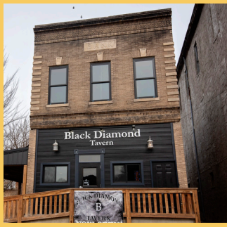
Black Diamond Tavern