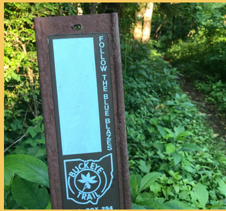
Buckeye Trail