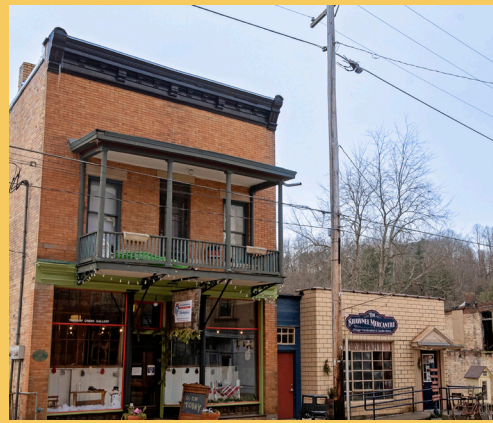
Ohio's Winding Road Marketplace & Shawnee Mercantile