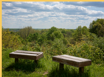
Monroe Overlook, #12

Discover camping, hiking, historical destinations, birding, biking & more!