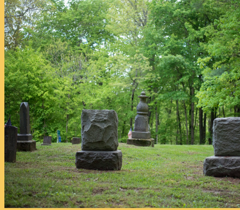
Payne Cemetery, #9